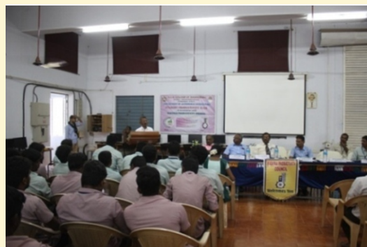
A seminar on "Health is Wealth" in Association with Madurai Productivity Council held on 21.12.2017