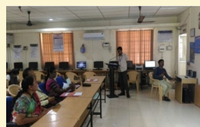
ODYSSEY-Maths Club 10.11.2017