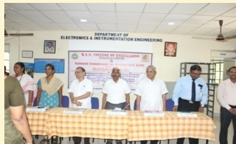
“Awareness program about legal rights of women”-07.11.17.