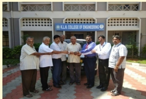
Hyundai Car CRETA as donation from HIMF Sukrith Hyundai.