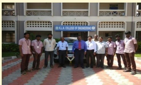
Hyundai Car CRETA as donation from HIMF Sukrith Hyundai for Demonstration and Education Purpose.