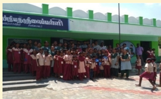
The Social club "Journey to Society" of ECE department visited Government Higher Secondary School at Pottapalayam on 05/10/2017 with 40 Final year students and 3 Staff.