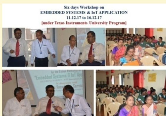
Six days workshop on embedded systems & IoT applications under Texas Instruments University Program during 11 th to 16 th Dec 2017, in association with Steps Knowledge services, Coimbatore.