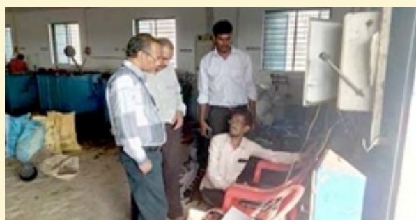
Energy audit at M/s Ramya Cottage, Karisalkulam, Sivagangai