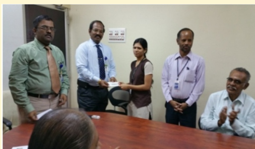
Prize Winners in “Nationwide competition to create awareness about legal rights of women” 10.11.17