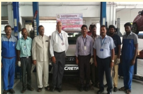
Hands on Training Program on HYUNDAI CRETA held on 12.11.17 at Sukrith Hyundai, Madurai.