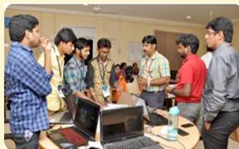
Hackathon 2K17 in association with Honeywell Technology Solutions. A non-stop 24 hours project contest