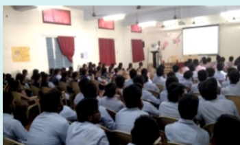
Digital Image Processing