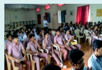
Seminar on Significance of GATE scoring