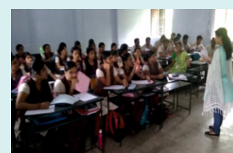
Skill Connect competition