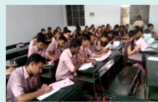
TCS Specific training