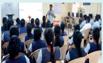
Expert Talk on Machine Learning and Artificial Intelligence