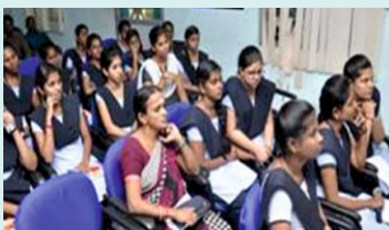
Expert Talk – LAMP