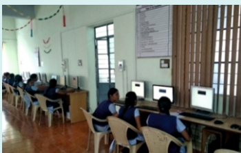
Technical online quiz