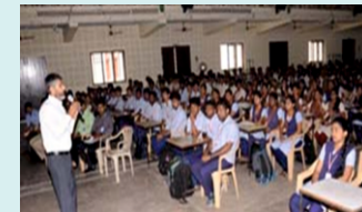
HCL Madurai Hackathon Workshop