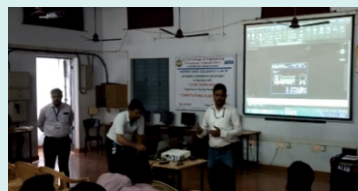
Workshop on "Computational Fluid Dynamics"