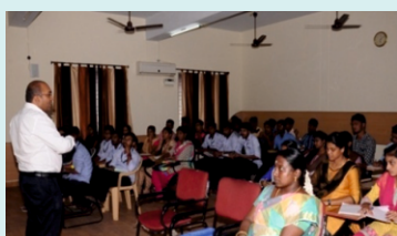
Workshop on Deep Learning – AI for Visual perception