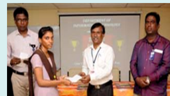
Excellence Award Ceremony