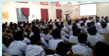
Future technology in IT