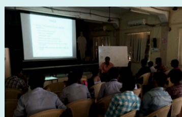
Workshop on "HADOOP and Big data Analytics"