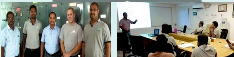
Knowledge Transfer, Training Classes by KLNCE Faculty to Industry, E.L.D.Parry (India) Ltd