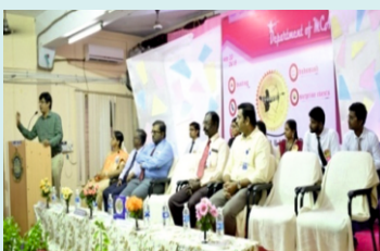
Technical Symposium "VYUHAM 2k18"