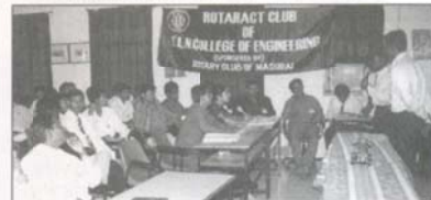
Inter Department Paper Presentation Contest Organized by the Department of Automobile Engg. Sponsored by Rotaract Club, KLNCE