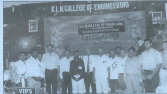
Annual day & Cultural day committee members