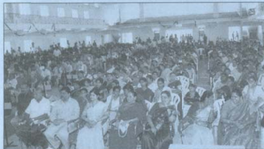
Audience enjoying the cultural programs