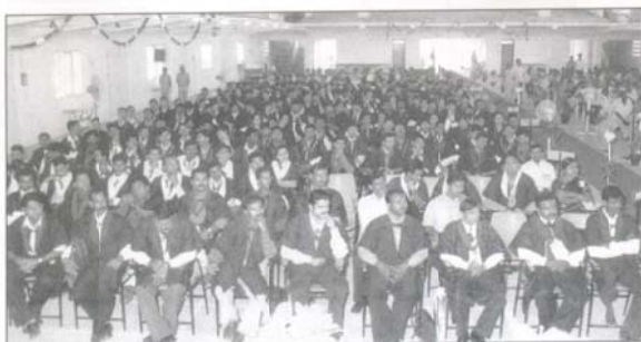
A Glimpse of UnderGraduates and PostGraduates of various disciplines