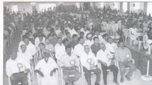
A view of audience at the annual day function