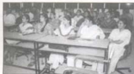
Professional Core Competency Development Program