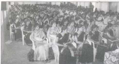
A group of angels in women's day celebrations