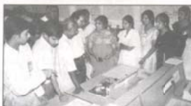
Mini Project Contest organized by EIE Department