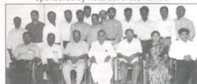
Short term course on "Design of Jigs & Fixtures" organized by the Dept. of Mechanical Engg.