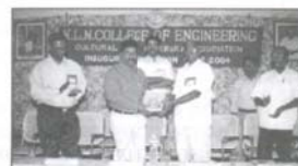
Inauguration of Cultural and Literary Association