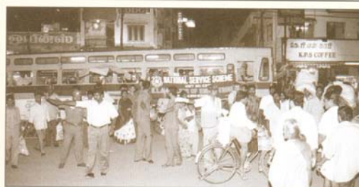
Our college NSS students helping Traffic Wardens in regulating the pedestrian traffic during Deepavali (09.11.2004) in Periyar Bus Stand area.