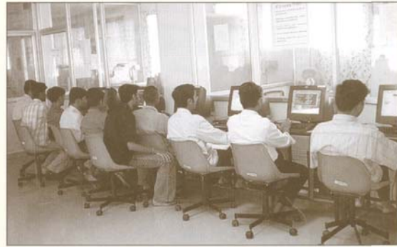
Students getting trained in IBM DB2 Universal DataBase