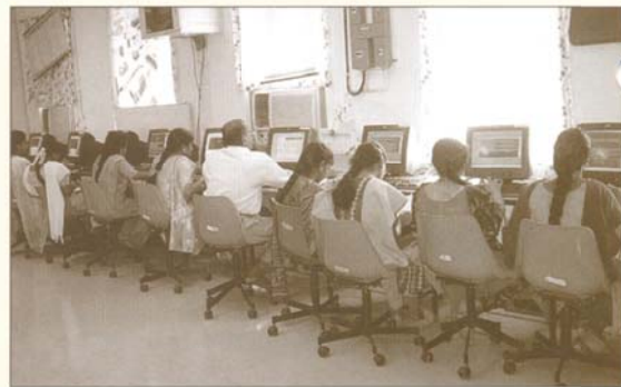
Students and Staff getting trained in IBM DB2 Universal DataBase