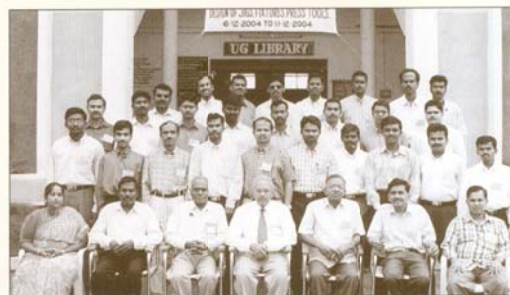
Short term FDP on Design of Jigs, Fixtures and Press Tools conducted by the Department of Mechanical Engineering