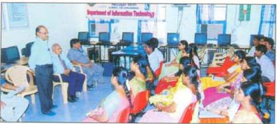
EMC2 inaugural Function on 11-8-08