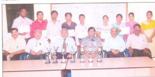
Our Students have got 2nd prize in the event orchestra held at Yadava College organised by Hello FM Radio