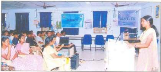
Multimedia Presentation on the topic "Behind the Scenes" on 5-8-05