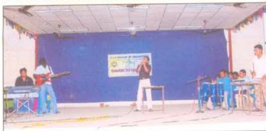
Teacher's Day Celebration Orchestra performed by our students on 05-09-2008

HP - Compaq commercial desktop server, Intel core 2 duo E 4600 Processor (2.4 GHZ, 2 MB Cache, 800 MHz FSB) Intel G33 Chipset Motherboard, 2 GB DDR 2 Ram, 160 GB Sata HDD, HP Keyboard & Optical mouse, HP 17" TFT LCD Monitor.