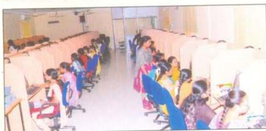
III Year & Final Year Students Undergoing 5 days training on "DCS" Training Program from 26-8-08 to 30-8-08