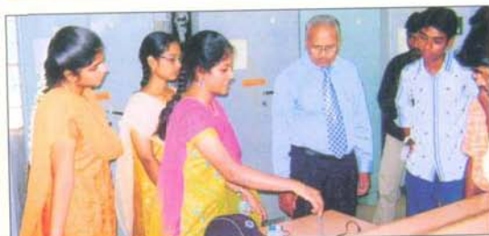
Mini Hardware Project Contest held on 11-9-09