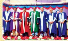
16 th Graduation Day 01.03.2014

குறிப்பு : கல்லூரிக்கு வர முற்பகல் 9.00 மணிக்கு மதுரை பெரியார் பஸ் நிலையம் அருகில் வசந்தம் ஹோட்டலிலிருந்து மகால், கீழவாசல், முனிச்சாலை, சந்தைபேட்டை, தெப்பக்குளம் வழியாக கல்லூரிப் பேருந்து ஏற்பாடு செய்யப்பட்டுள்ளது