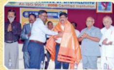
Founder's Day Celebration 02.01.2014