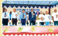
DEBUT Day 2013 (01.08.2013)