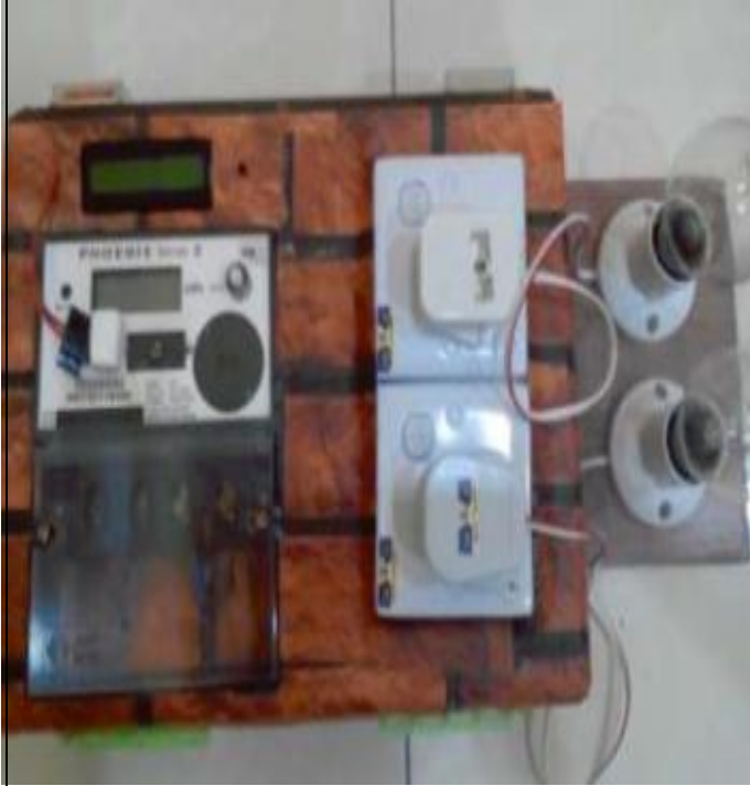
Figure 2: Energy meter with loads of 2 lamps

In figure 2 shows the box covered the circuit, only Energy meter and LCD can be seen from the outside. The material for the box is plastic PVC with A4 size and cover with stickers wallpaper. The socket was implementing as a switch between load and the energy meter. So that, 2 lamp can be used as the load. Each lamp can give load for 100W for 1 hours. The LCD display had been place at the top side of the meter while beside the LCD, the LED indicator will blink when counting 1 pulse. The sensor was placed close to the LED at the Energy Meter to catch the blinking when 1 pulse. This prototype might be different to the real product in the future. It must be well arranged without the socket close to the Energy meter and the box should be built with the proper material such as wood or Perspex transparent.