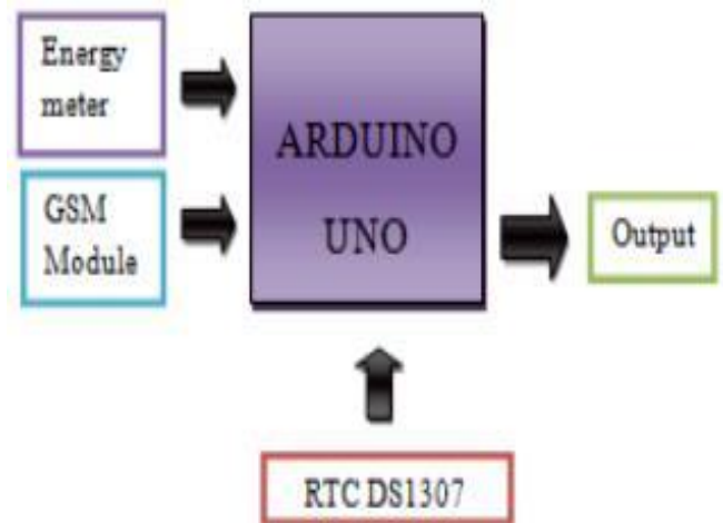
Figure 1: Block Diagram of the System

The System consists of hardware and software part. Figure 1, the hardware parts, shows the block diagram of energy meter project that the users can monitor their home current power consumptions anytime and anywhere. As for the software part, all the program located in Ardduino UNO, using C language. Arduino UNO, as the main controller, connect energy meter, GSM module, and other sensors/peripherals so they can communicate each other. And Arduino UNO can only work after we uploaded the designed program into it.