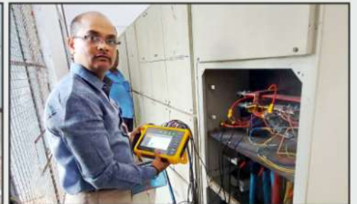
Energy Study & PQ Audit at Main Panel Board