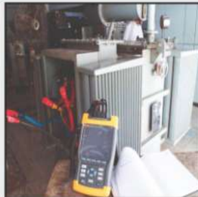
Energy & Harmonic Audit at 1000 kVA Transformer Secondary side