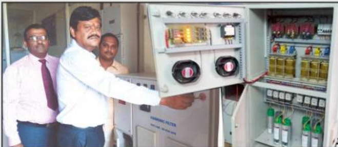
Three Phase Harmonic Filter for 20 kVA UPS