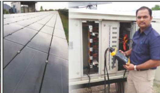
PQ Audit at 1MW Grid Integrated Solar Power Plant