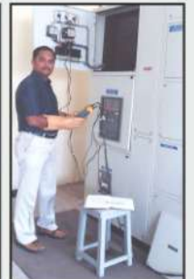
Harmonic Audit at M.V Panel ACB Incoming